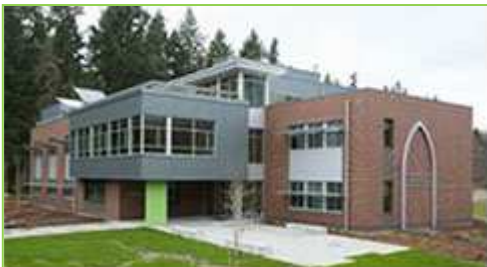
Above- Cebula Hall, St Martin's University's new cutting-edge, teaching and learning engineering facility. Below Students at the Region J meeting.

EWS will be hosting a SWE-EWS "Working in Teams" at 6:00 pm on Thursday June 13th (location to be determined). The event will feature a module created by the SWE Leadership Coaching Committee designed to give an overview of team dynamics through review of the five stages of team development. The module includes teambuilding activities to bring out the common interests of members and promote "teammess". Food will be provided. Look for further information in the email updates.